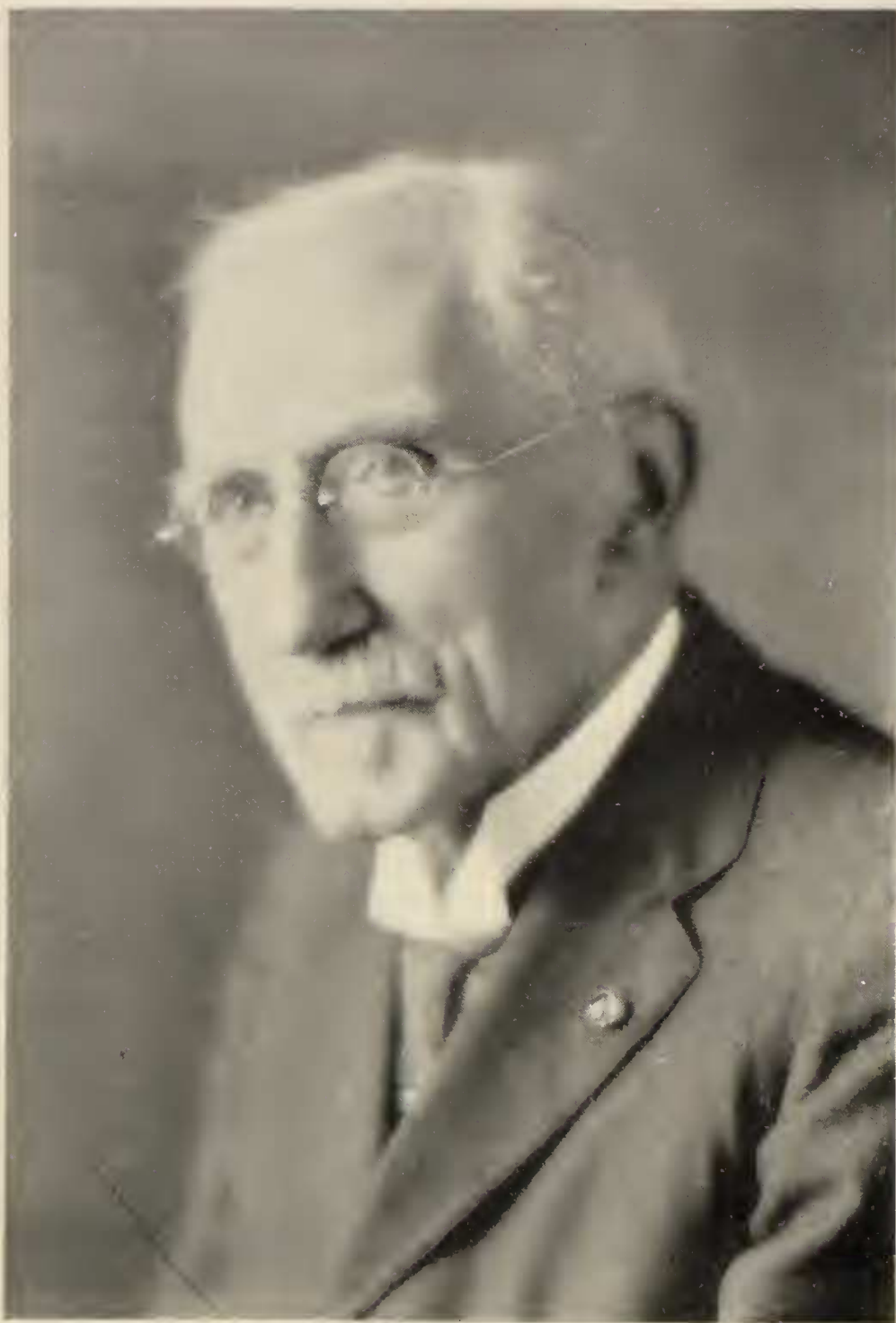
FIG. 44. Stephen Alfred Forbes, 1844-1930.